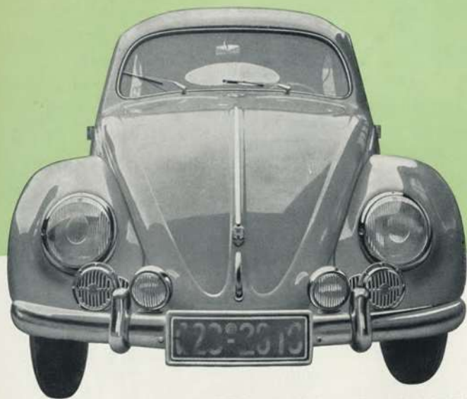
Built-in headlamps, foglamps and horns on the VW 1953/54