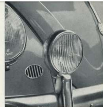
Fitting the foglamp